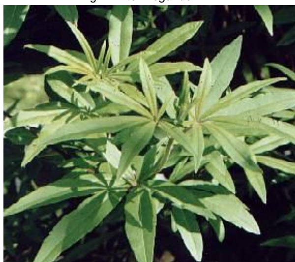
Fig. 2. Vitex negundo Linn.

Parts used : Whole plant (Orient Longman, 1996).